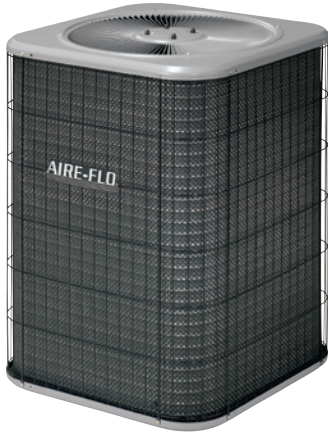
13HPD R-22 Ready

With a wide range of capacities and configurations, Aire-Flo® air handlers match almost any air conditioner or heat pump.