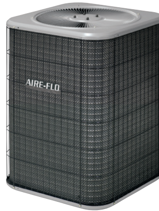
13ACD R-22 Ready